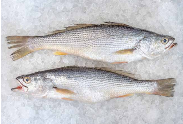
Sea trout Cynoscion guatucupa