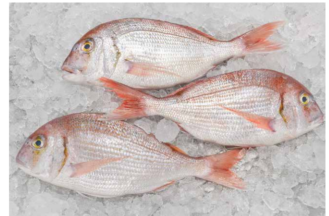
Red Snapper Pagrus pagrus