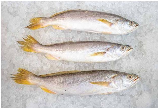
King Weakfish Macrodon ancylodon