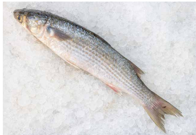
Grey Mullet Mugil platanus