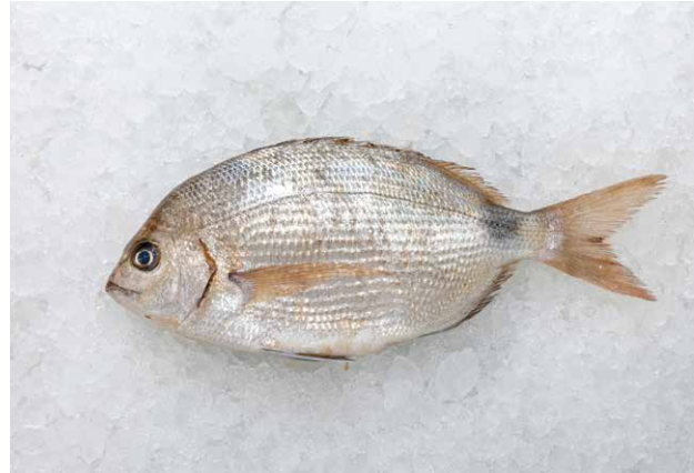
White bream Diplodus argenteus