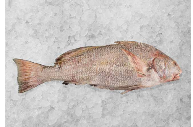
Black drum Pogonias cromis