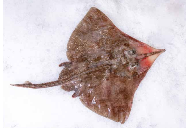
Skate Dipturus chilensis