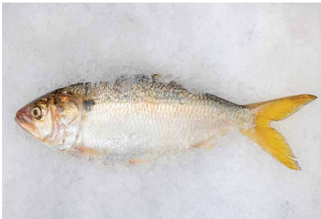
Brazilian Menhaden Brevoortia aurea