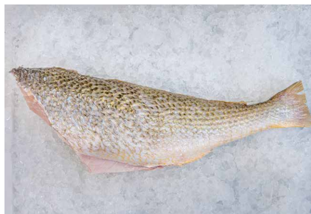
Yellow croaker HG