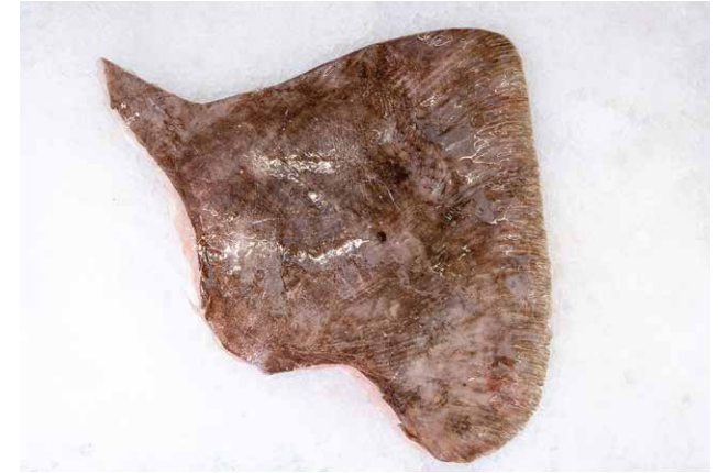
Skate wing Dipturus chilensis