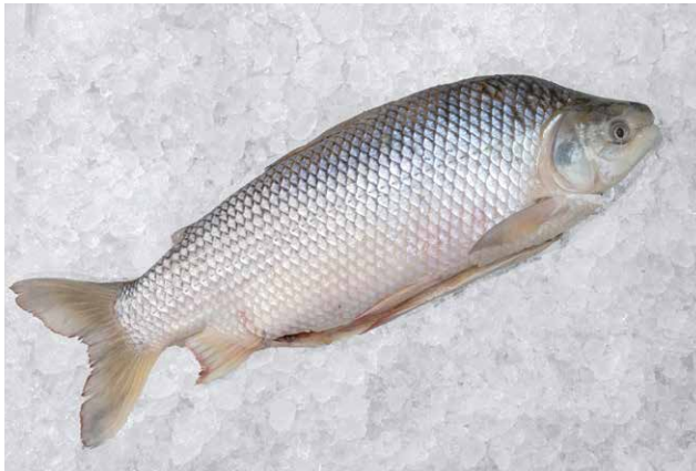
Sabalo Prochilodus lineatus