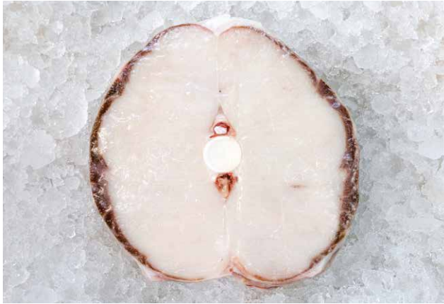
Shark Prionace glauca