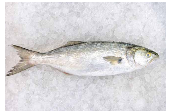
Blue fish Pomatomus saltatrix