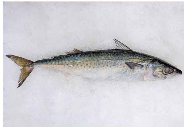
Mackerel Scomber japonicus