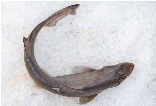
Tope shark Galeorhinus galeus