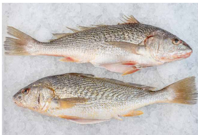
Yellow croaker gutted and scaled