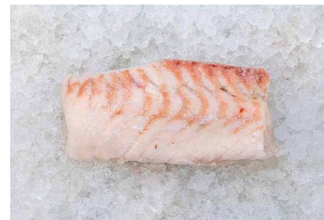
Frozen Croaker fillet