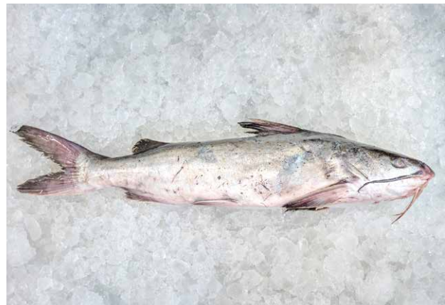
Catfish Genidens barbatus