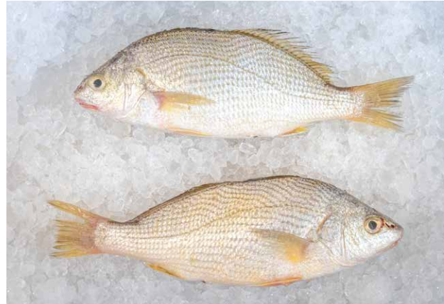
White croaker Umbrina canosai