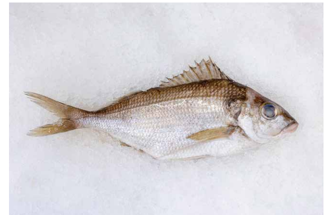
Hawkfish Nemadactylus bergi