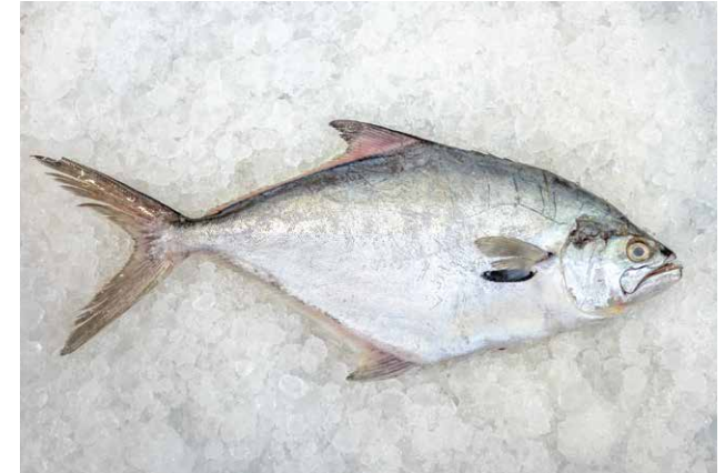
Parona leatherjack Parona signata